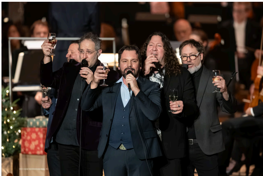
Le Vent du Nord with the OSM in December 2024

Three new brief and themed late-night concerts , followed by a festive evening in the Foyer await you in 26–27. On November 5, to extend the Halloween fun, don your capes and masks for Symphonic Superheroes & Villains , an epic tribute to these musical themes,