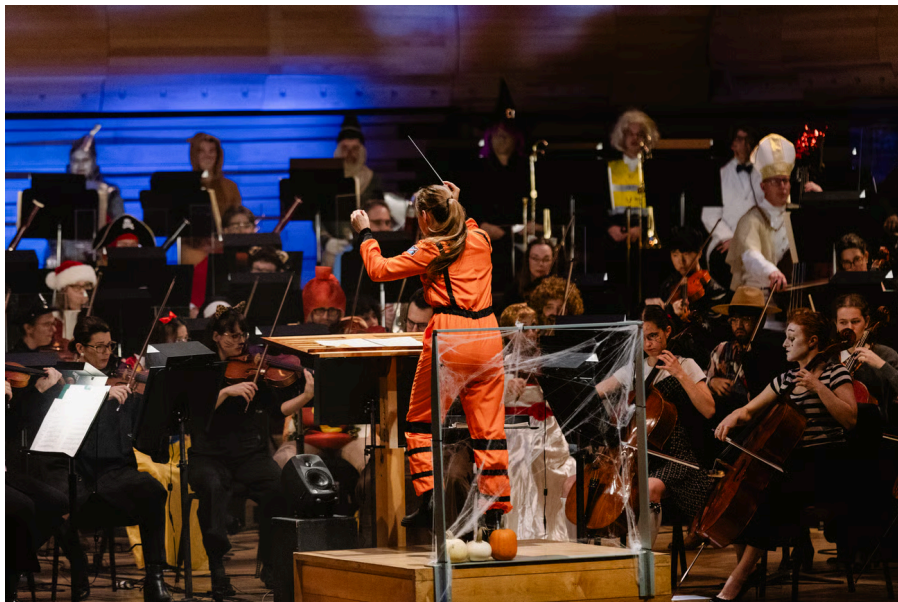
OSM's Associate Conductor and the OSM at Halloween 2025