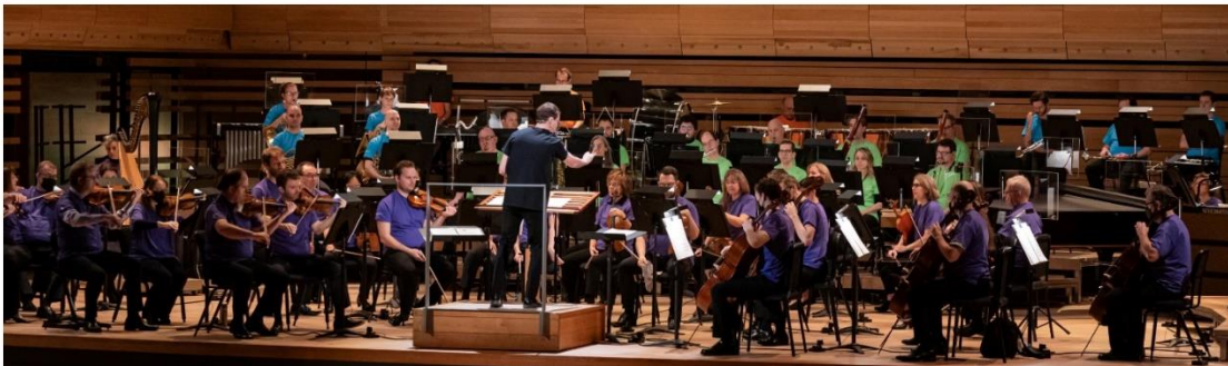
OSMose Concert – November 2022